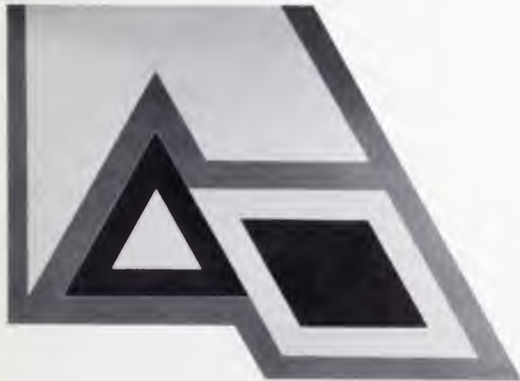
Frank Stella, Sanbornville III , 1966

in art an austere, formalist sensibility. Art adopted inflexible and authoritarian qualities being abandoned by society as a whole. Minimalism in the 1960s continued the non-objective developments in twentieth-century art that can be traced from Malevich to Mondrian in Europe and, in America, from 1930s geometric abstraction to the early 1950s paintings of Josef Albers, Ellsworth Kelly, and Ad Reinhardt. In Minimalism individual personality was repressed in favor of impersonal execution, serial progressions, and monochromatic and mathematically conceived compositions. The physical properties of materials for their own sake were stressed. Sculpture, with its material and textural emphasis, played a more vanguard role than ever before. Untitled works—works unprejudiced by any associative or narrative connotations—became the norm. Minimalist works are not about external reality, but about themselves; not so concerned with what was made, but with a fusion of process and product. Richard Serra explained his art as "revealing the structure and content and character of a space and a place by defining a physical structure through the elements that I use . . ." Tony